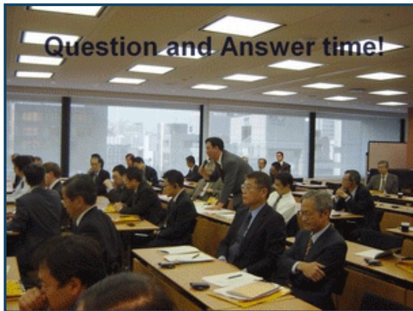
The ITPO Tokyo - GAFI Egypt Investment Seminar

Between March and June this year, UNIDO Investment Technology Promotion Office Tokyo ( ITPO Tokyo ) hosted delegates from Egypt (22 March - 23 April), Morocco (10 May - 17 June), Sri Lanka (10 May - 11 June) and India (17 May - 18 June), to undertake investment and technology promotion activities in Japan.