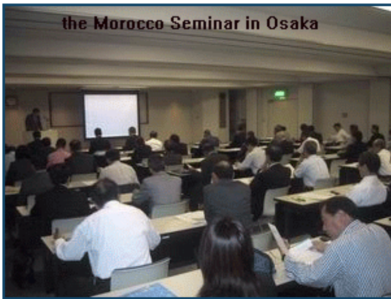
at the ITPO Tokyo -Morocco Investment Seminars in Tokyo and Osaka

delegates to go home with valuable contracts. Regardless of the immediate result, all go back with valuable contacts. ITPO Tokyo is one of the most active promoters of the Delegate Programme.