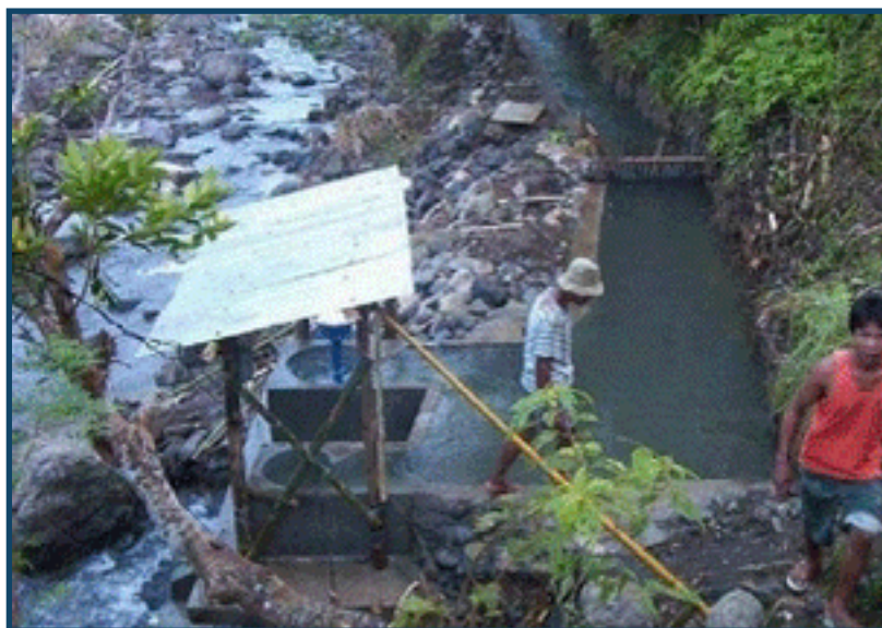
the Second UNIDO-INSHP International Seminar on Small Hydro Power (SHP) Cooperation among Developing Countries held at Hangzhou & Chenzhou, China from 16 to 23 April 2004

Hangzhou and Chenzhou, China 16 -23 April, 2004