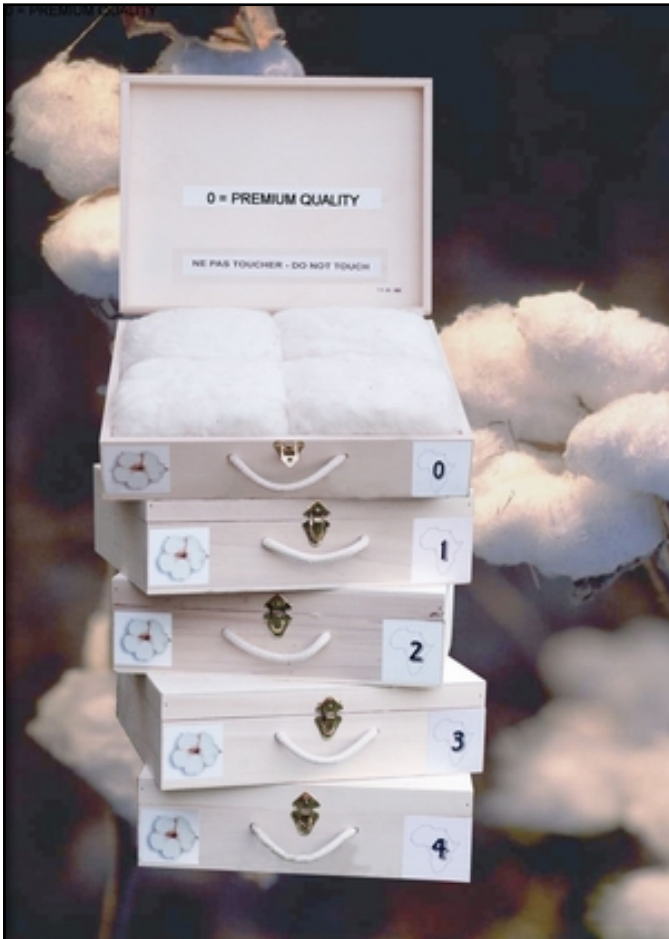
a cotton standard for Western and Southern Africa developed under the programme enables producers in the eight UEMOA countries to market five different classes of cotton (with four grades in each class)

Another of the achievements to be profiled at Ouagadougou is the development, in cooperation with the Societe De Services Pour L'Europe Et Pour L'Afrique (SOSEA) and the African Cotton Association, for the first time, of a cotton standard for western and central Africa. This enables cotton producers in the eight UEMOA countries to market five different classes of cotton graded according to colour, length and presence of foreign material (each class has four grades), in contrast to one class previously. Two cotton classifiers from each country have been trained to train colleagues in their country to apply the standard. The African Cotton Association and the French Cotton Association AFCOT (Association Française Cotonnière) are publicising the standard.