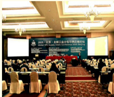
Conference hall Scene of Global SPX Supply Conference 2005 Beijing

management and processing capability, accelerate technical innovation, improve the product quality, increase their international competitiveness, and thereby attract more investment and orders, then expand the scale of processing, service and export, increase the revenue, create more job opportunities, gradually get involved in the global market and participate in the global production system and supply chain.”