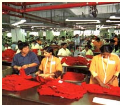
Bangladeshi people working in the textile sector

As a newcomer in this business area, Bangladesh has good conditions and potential to cooperate with Western companies and enterprises in order to enhance more economic growth, which can consequently improve the country's standard of living. Although Bangladesh is a small country, its magnitude of available work force is impressive. The abundant supply of disciplined, easy-trained and low-cost working force is capable and sufficient for any labour-intensive industry.