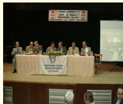
General Assembly of the Union of Chambers of Greece

UNIDO SPX attends the General Assembly of the Union of Chambers of Greece, Florina, 2 July 2005