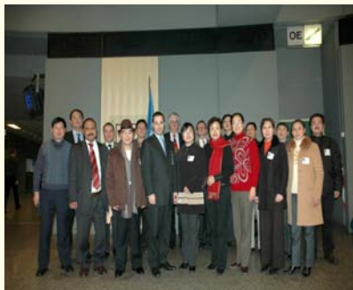
Chongqing Delegation at UNIDO Headquarters

The participation in MIDEST 2004, an international subcontracting fair, and visits to the ITPO in Paris, the UNIDO Headquarters in Vienna and the famous engine producer Italian Lombardini by a Chongqing delegation of local companies was the result of 10 preliminary orders which totally valued over $100 million.