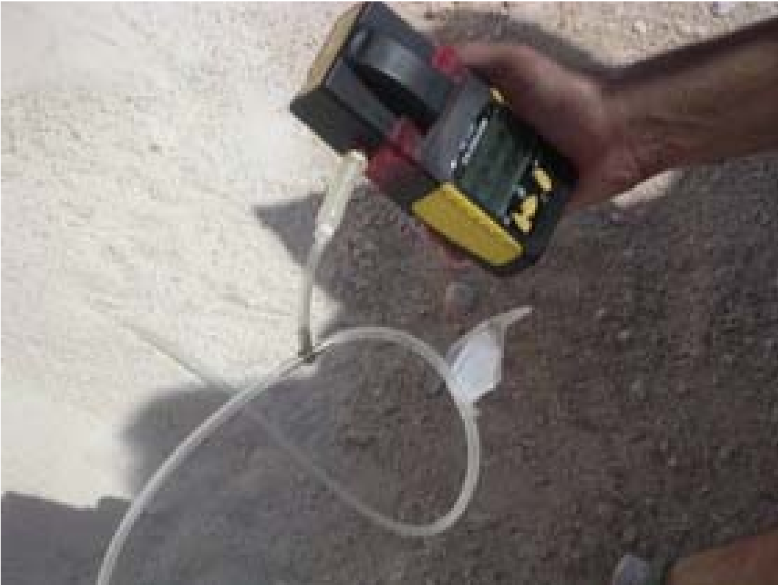
PH3 meter calibration.