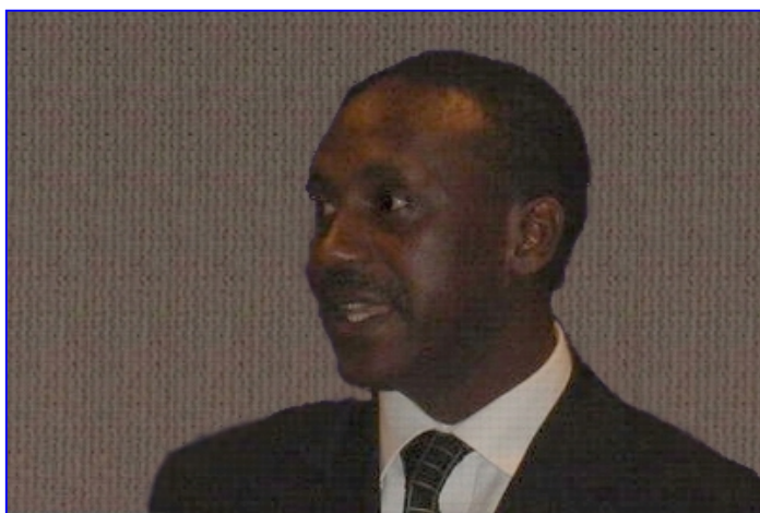
UNIDO Director-General Kandeh Yumkella addressing the UNIDO side event on Chemical Leasing and Cleaner Production