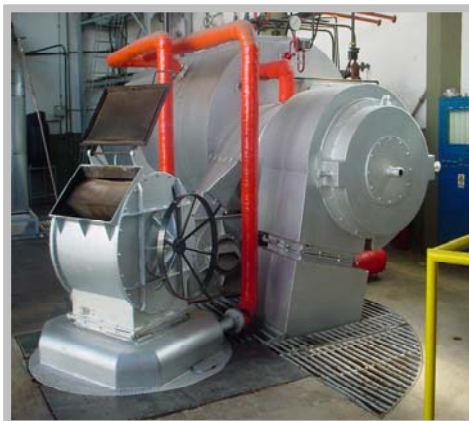
Biomass Gasification Technology for Process Heat Applications