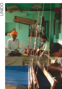
The Chanderi handlooms cluster in India employs nearly 10,000 weavers