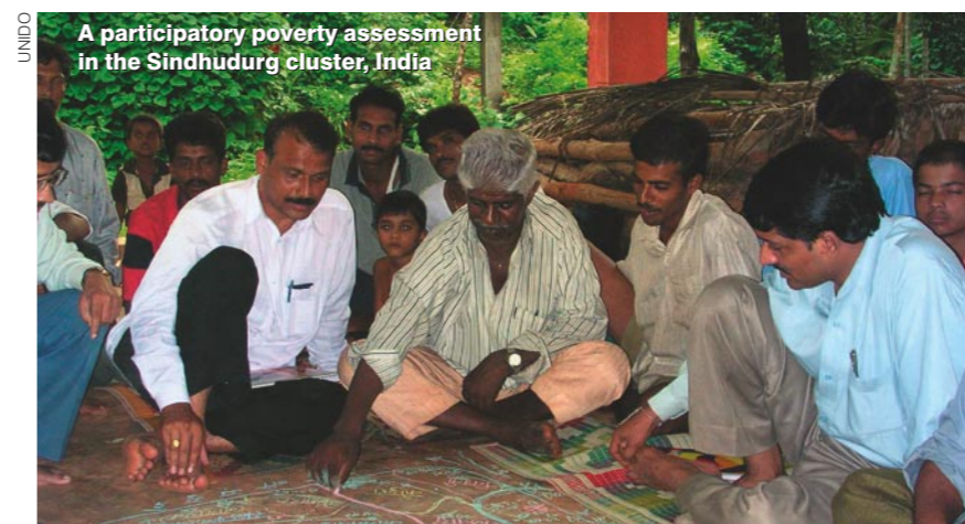
A participatory poverty assessment in the Sindhudurg cluster, India

The challenge for UNIDO is to understand better the poverty consequences of its cluster development policies. This requires developing poverty and social impact assessment methodologies that measure impacts on poor groups within clusters, thereby strengthening the pro-poor aspect of cluster development policy.