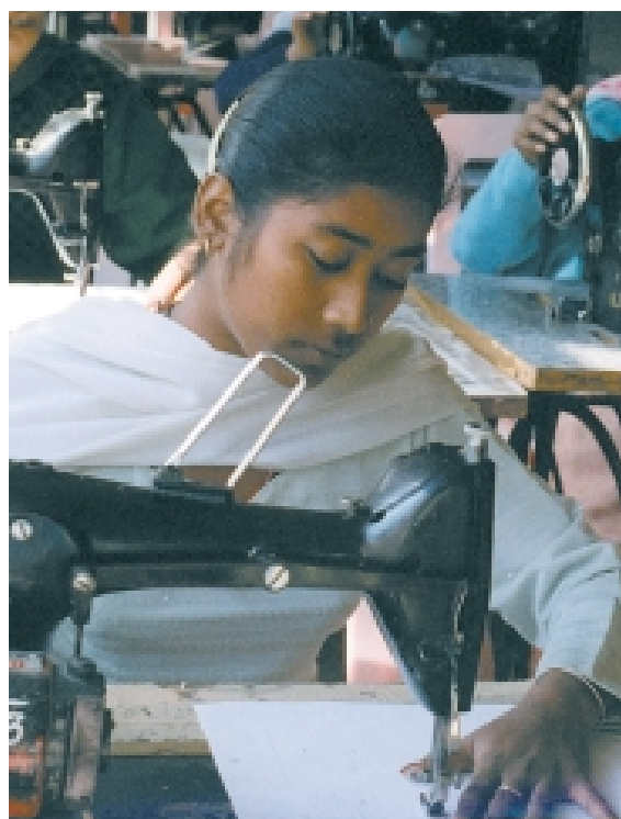
India - Ludhiana cluster, women trained by the UNIDO programme

At all stages, however, local actors fully and actively participate in the definition of joint activities, they are called to monitor progress in implementation; and they ensure that mutual commitments are maintained.