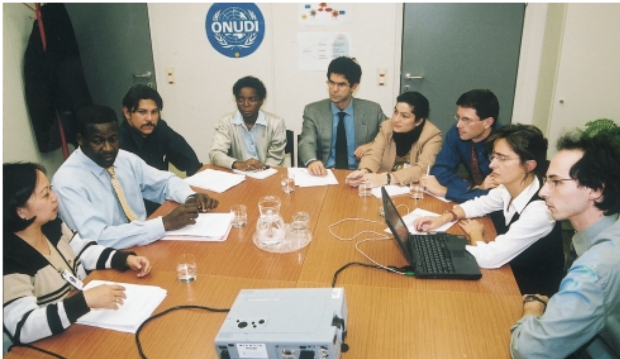
Joint Learning Programme in Vienna