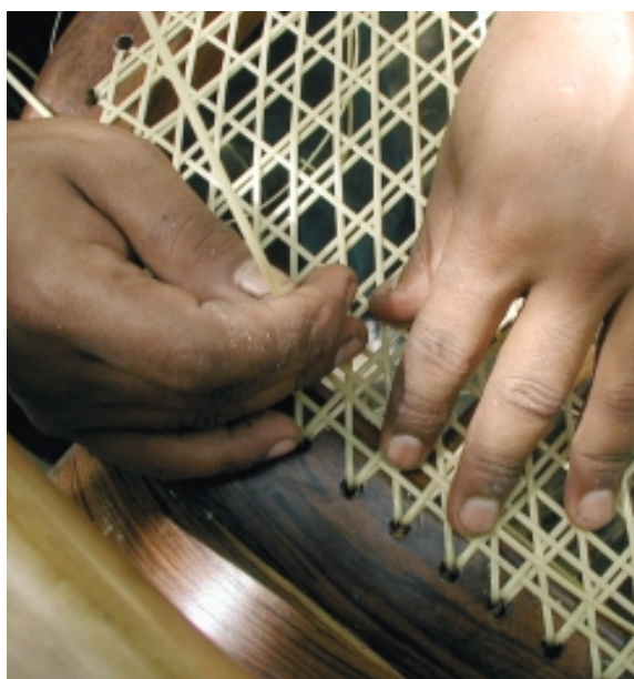
Nicaragua - Masaya, detail of chair making

Similar to the Senegalese case, in Zimbabwe networks are more than an end in themselves. By building networks, the project also aims at triggering the restructuring of several business development service providers for technical and managerial skills, quality management services, design services and the like. The idea is to organize demand for those services in a more systematic way in order to have a consolidated approach towards BDS providers and - through the networks - stimulate the offer of upgraded and more efficient services.