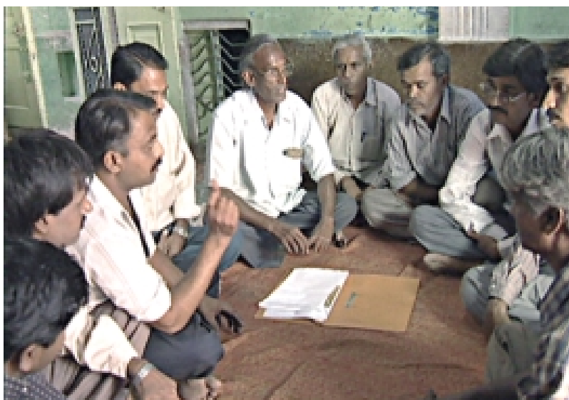
India - Sanganer, network of hand-block printers