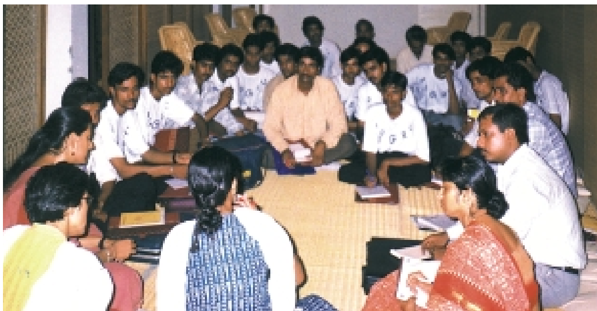
India - Bagru cluster, training of young artisans