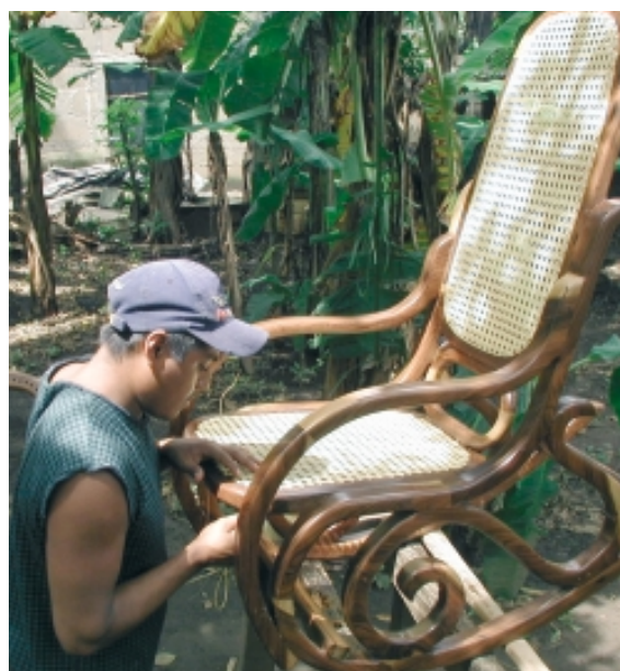
Nicaragua - Masaya, rocking chair for export