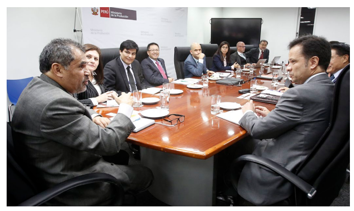
The UNIDO delegation during a meeting with representatives of the Ministry of Production; the Ministry of Economy and Finance; the Ministry of Foreign Affairs; and representatives from national and international development finance institutions, including the World Bank Group, Inter-American Development Bank, the Andean Community Fund and Peru's National Development Bank, COFIDE.

The Partner Donor Working Group (PWDG) will generate investment and technical assistance portfolios and mobilize funds for inclusive and sustainable industrial development in Peru. The PDWG will therefore bring together a working group of technical and financial partners led by the Ministry of Economy and Finance, the Ministry of Production, and the Ministry of Foreign Affairs, to coordinate all related resources and programmes.