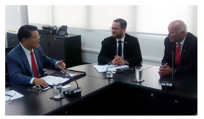
Eduardo Ferreyros Küppers (Right), Minister for Foreign Trade and Tourism, pledged his support for the PCP Peru and agreed to join the National Steering Committee.