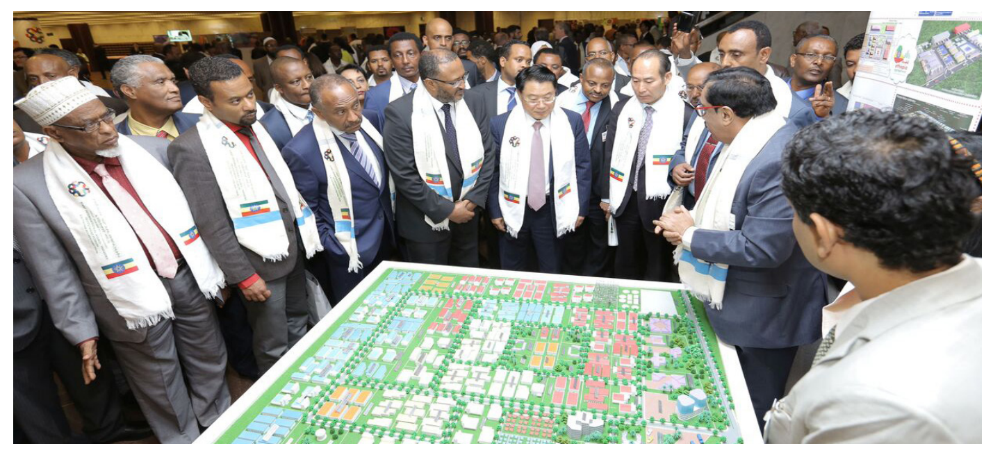
A 3D model of an integrated agro-industrial park viewed by participants at the forum.