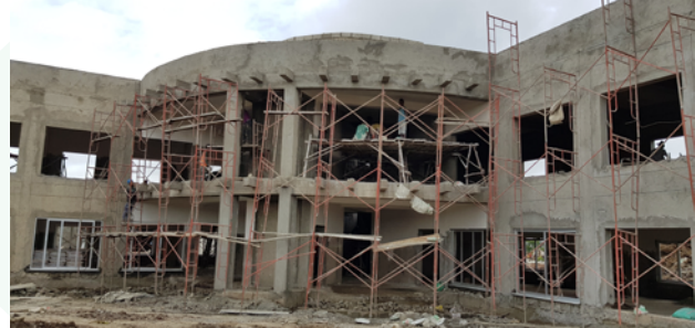
Photos: Ongoing construction of the Yirgalem IAIP, SNNP region. Market center and administrative building (top), and administrative building (bottom).