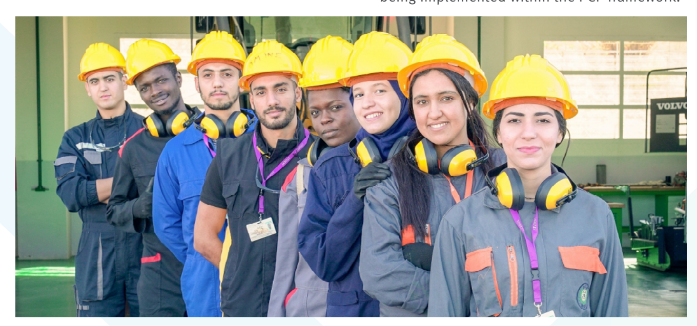
Photo: Senegalese students join the training programme at AGEVEC in Settat, Morocco.

Senegalese students benefit from specialized training in Morocco: The first ten Senegalese graduates from Morocco's Training Academy for Heavy Duty Equipment and Commercial Vehicles (AGEVEC) were awarded certificates at a ceremony held in Dakar, with fifteen more Senegalese students currently being trained. In addition, the selection process for the 2018-2019 in-takes will begin shortly. AGEVEC is a public-private development partnership initiated by the United States Agency for International Development (USAID), the Volvo Group, the OCP Foundation, the Moroccan Ministry of National Education and Vocational Training, OFPPT and UNIDO, which has established a hands-on training programme in heavy machinery and commercial vehicle maintenance to meet the current needs of the industrial sector. In Senegal, its activities are being implemented within the PCP framework.