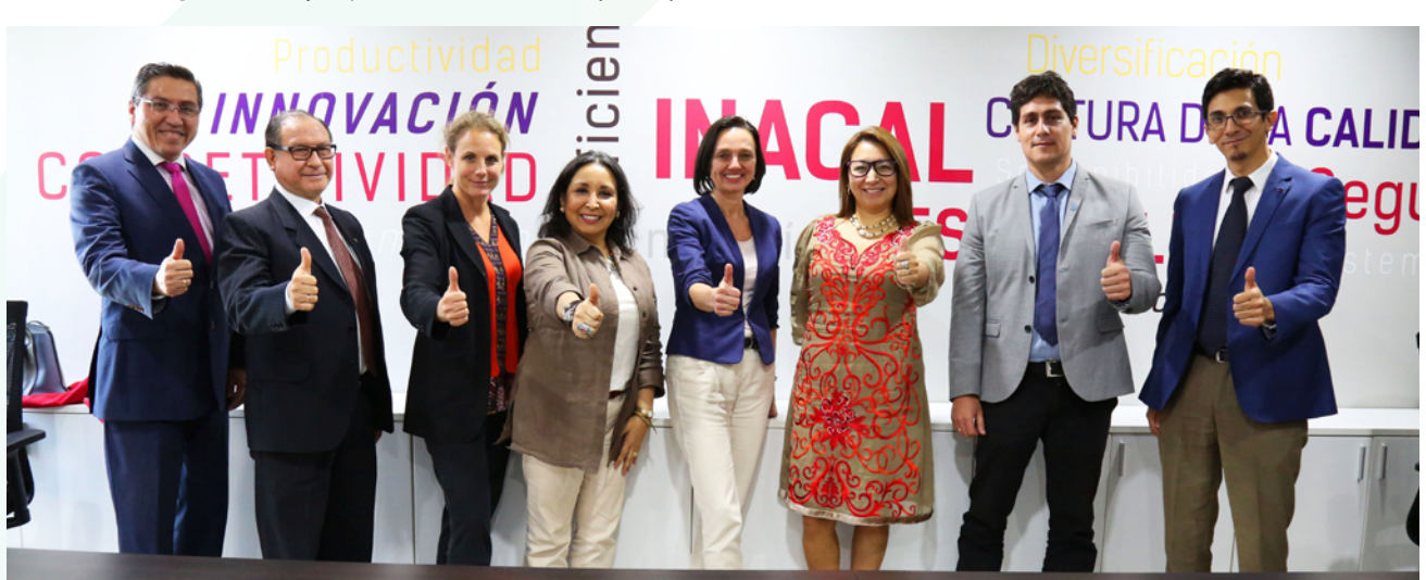
Photo: UNIDO and INACAL sign project document on quality and compliance in the coffee and cocoa sectors.