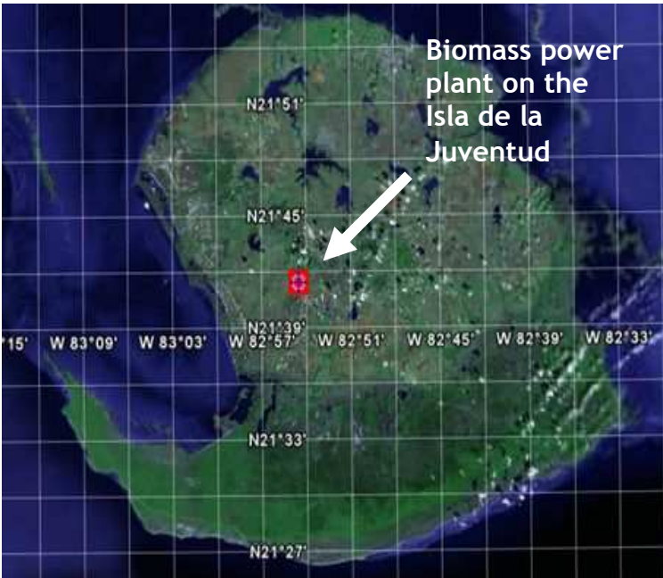
Biomass power plant on the Isla de la Juventud