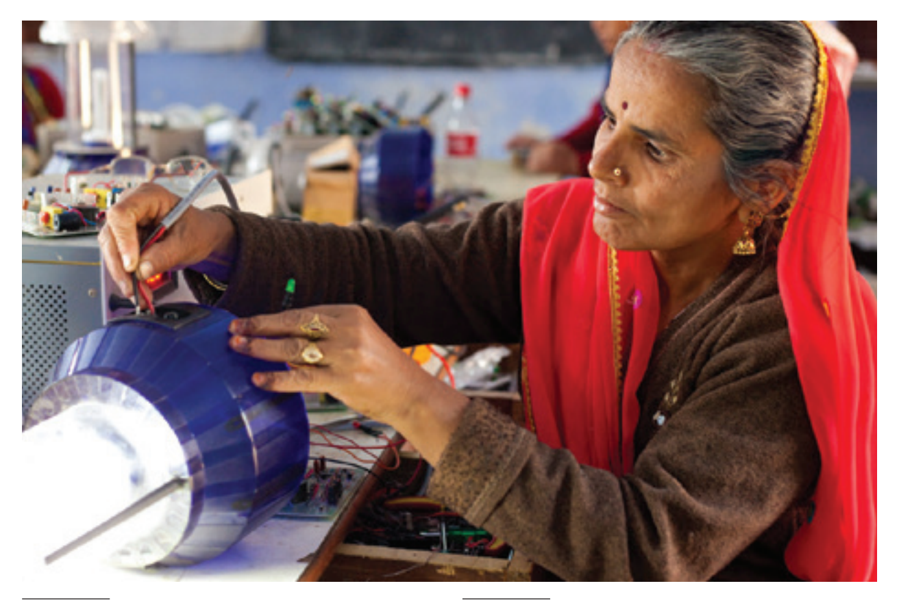
<sup>5</sup> UNIDO, "Gender Inequality and its Effects on Industrial Development", 2012. Available at: http://www.worldwewant2015.org/node/282863.

However, to date, the majority of industrial equipment and technology is developed by and for men, and is not always appropriate or accessible for women. There are limited education and training opportunities for women, as well as scarce resources and support for women's movements, networks, and entrepreneurship in green industry. Public and private expenditures towards the creation of genderfriendly work environments remain low, and provisions such as child-care, safe and reliable transportation, and flexible working hours that allow women to combine the household care with income-generation are non-standard. Additionally, there tends to be a bias in labour policies that dictate gender differentials in earnings. Perhaps at the root of this is the fact that women are usually under-represented in decisionmaking and leadership positions, leaving them at the periphery of green industry policies and investments.