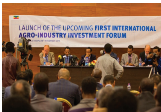
Press conference in Addis Ababa

UNIDO is preparing more than 200 investment profiles and ten green field investment projects for presentation to international and local investors. Over 500 participants are expected to take part in the event.