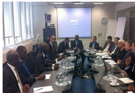
Senegalese delegation meets UNIDO PCP Senegal team