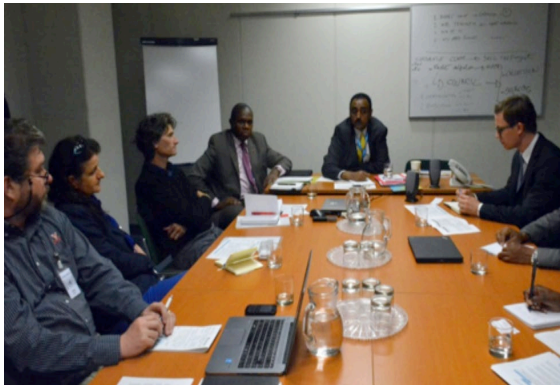
PCP Ethiopia coordination meeting in Vienna

UNIDO and Ethiopian government officials held a series of meetings to discuss progress and agree on next the steps of PCP implementation. They addressed issues such as resource mobilization, investment promotion and coordination with potential partners.