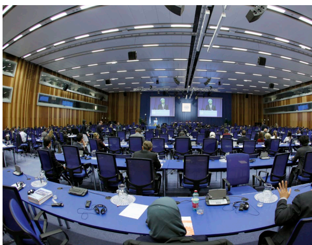
The fourth ISID forum

In Ethiopia, early achievements include the set-up of national structures for PCP governance and monitoring, completed feasibility studies for integrated agro-industrial parks, and several investors already mobilized for infrastructure development. Among other successes, the PCP Senegal has established a national coordination mechanism, and developed an incentive package and business plan for the country's first integrated industrial platform. Public financing of an amount of USD 32 million has been mobilized for this industrial platform, construction has already started and the first garment factory is expected to start operations in February 2016.