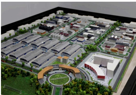
Model of industrial park to be established in Ancon, Peru