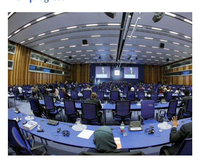
The fourth ISID forum

In Ethiopia, early achievements include the set-up of national structures for PCP governance and monitoring, completed feasibility studies for integrated agro-industrial parks, and several investors already mobilized for infrastructure development. Among other successes, the PCP Senegal has established a national coordination mechanism, and developed an incentive package and business plan for the country's first integrated industrial platform. Public financing of an amount of USD 32 million has been mobilized for this industrial platform, construction has already started and the first garment factory is expected to start operations in February 2016.