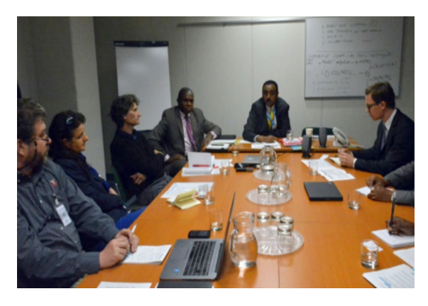
PCP Ethiopia coordination meeting in Vienna

UNIDO and Ethiopian government officials held a series of meetings to discuss progress and agree on next the steps of PCP implementation. They addressed issues such as resource mobilization, investment promotion and coordination with potential partners.