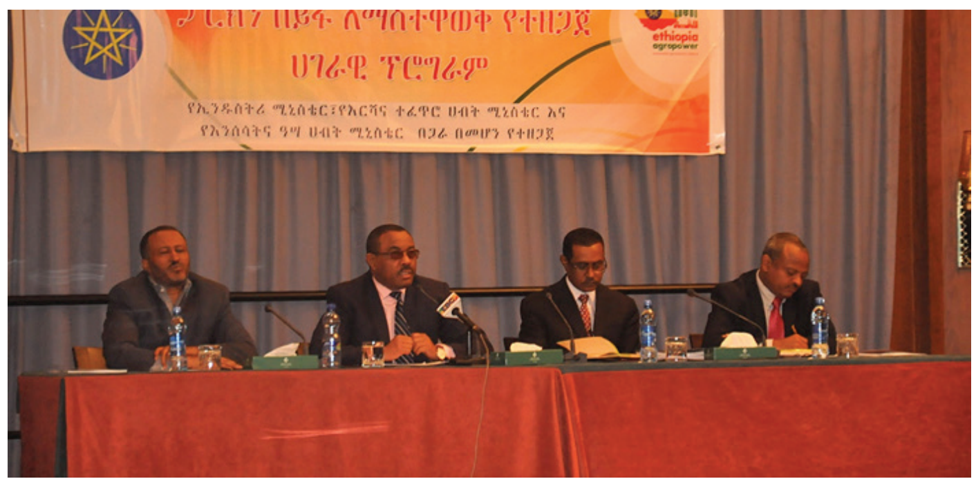
Launch of IAIP implementation phase in Addis Ababa.

http://www.unido.org/en/news/press/supporting-ethiopia-in-establishing-integrated-agro-industrial-parks.html