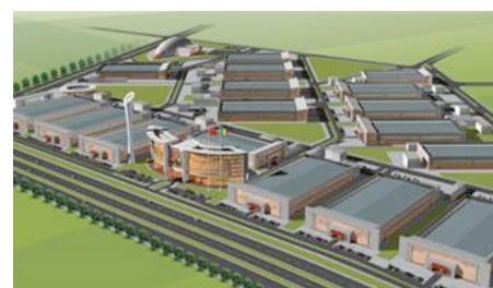
Diamniadio construction site, Senegal.