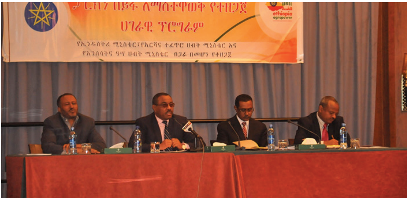
Launch of IAIP implementation phase in Addis Ababa.

http://www.unido.org/en/news/press/supporting-ethiopia-in-establishing-integrated-agro-industrial-parks.html