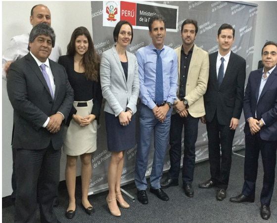
UNIDO team meets with government officials in Peru.

The year will see the start of the implementation of the Programme for Country Partnership for Peru after it was launched in December 2015. Programme formulation and partnership mobilization was the focus of a week-long UNIDO mission to Peru at the end of January. The UNIDO team was briefed on the progress of the National Plan for Productive Diversification (NPPD) and discussed a technical work plan for the PCP and possibilities for joint interventions, particularly with regard to the development of sustainable industrial parks, quality standards, and technological innovation centres. As a next step, UNIDO will outline the role and contribution of prospective PCP partners, and develop a roadmap for attracting investment from DFIs.