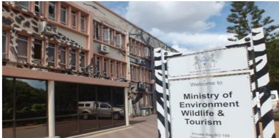
Ministry headquarters Khana Crescent Road, Gaborone