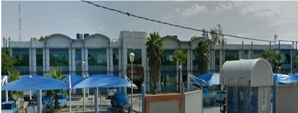
Department of Meteorological Services Metsimotlhabe Road, Gaborone