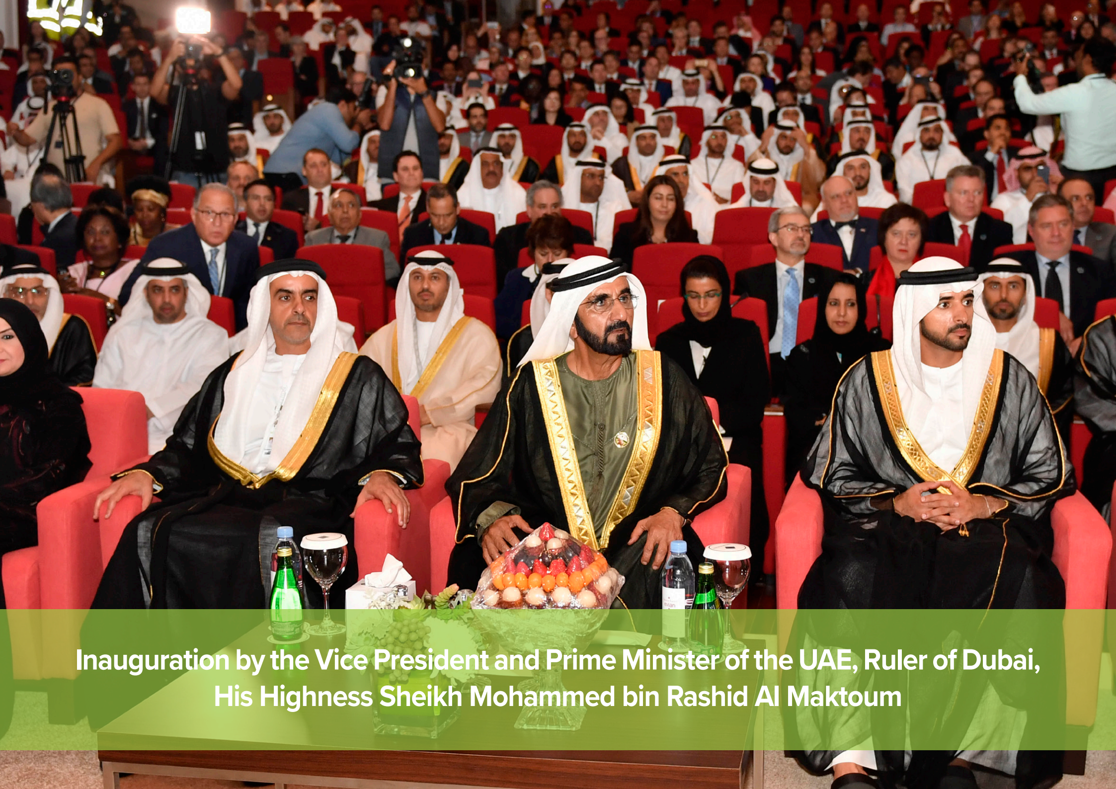
Inauguration by the Vice President and Prime Minister of the UAE, Ruler of Dubai, His Highness Sheikh Mohammed bin Rashid Al Maktoum