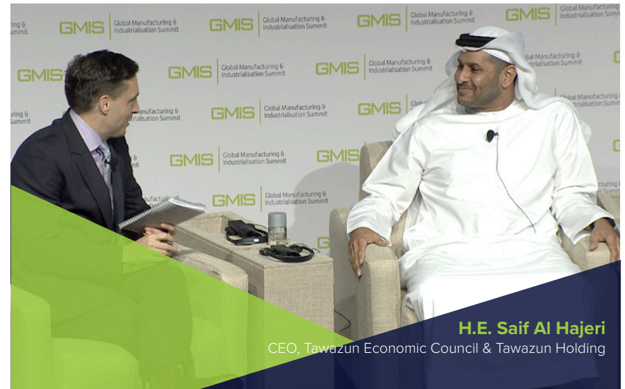
H.E. Saif Al Hajeri CEO, Tawazun Economic Council & Tawazun Holding

Al Hajeri advised manufacturers hoping to succeed in the UAE not to dismiss working with SMEs, as they currently make up approximately 70% of the UAE economy.