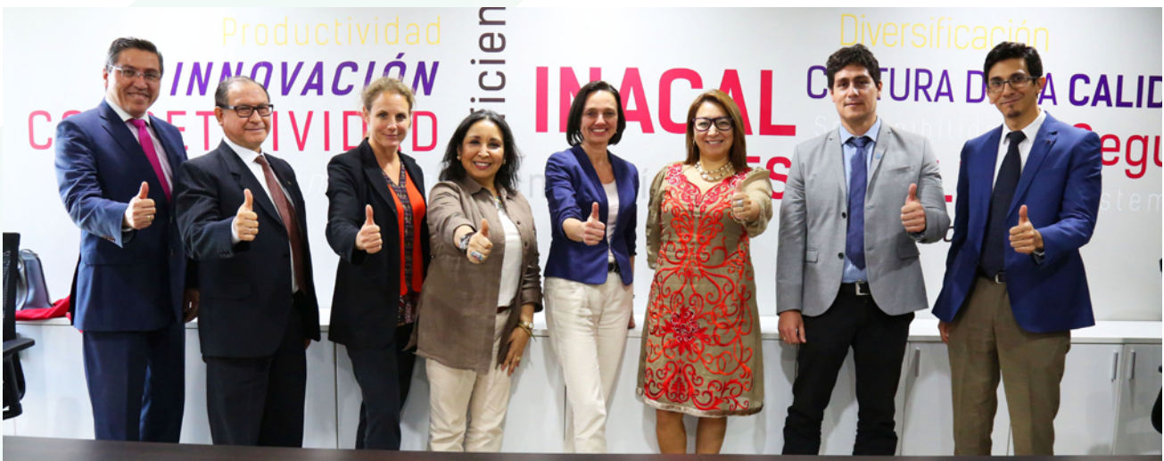
Photo: UNIDO and INACAL sign project document on quality and compliance in the coffee and cocoa sectors.