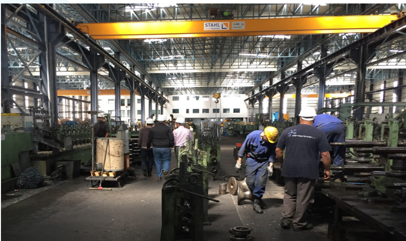
Photo: UNIDO project on resource efficient production in Morocco.