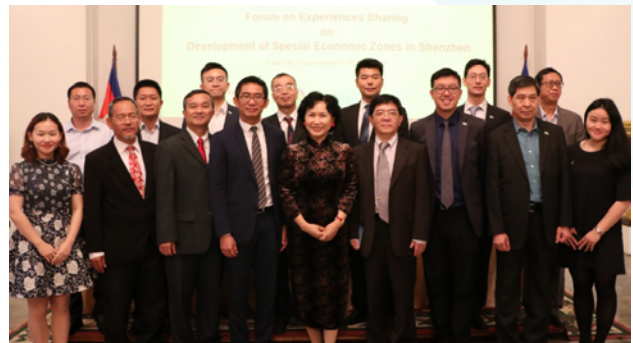
Photo: The Shenzhen Foundation for International Exchange and Cooperation shares its experience in the development of SEZs in Phnom Penh, Cambodia.

Commerce and the China Council for the Promotion of International Trade organized an investment exploration mission for over 40 Chinese company executives.