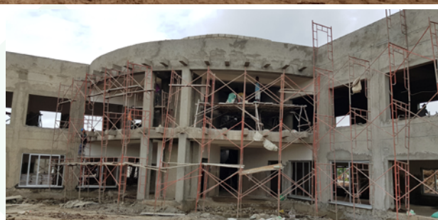
Photos: Ongoing construction of the Yirgalem IAIP, SNNP region. Market center and administrative building (top), and administrative building (bottom).