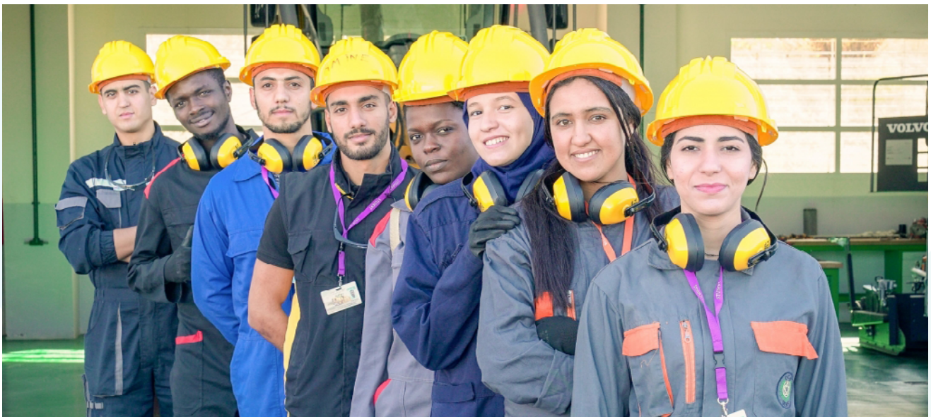
Photo: Senegalese students join the training programme at AGEVEC in Settat, Morocco.