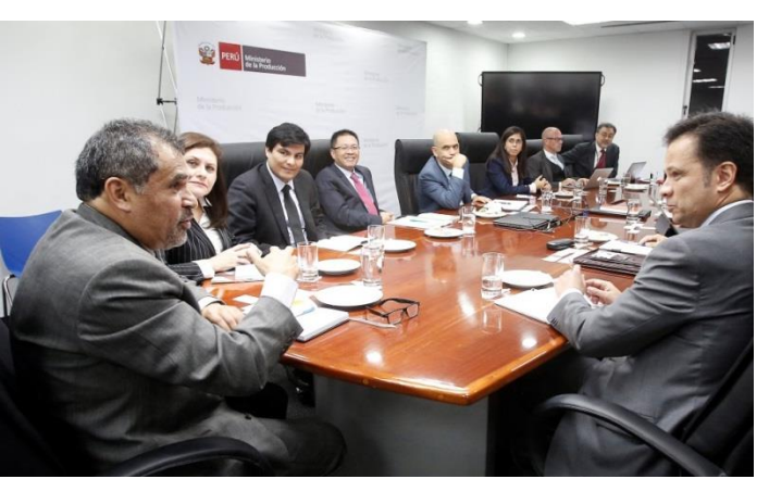
Meeting with Development Finance Institutions