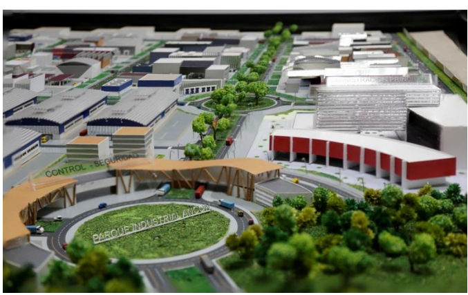
Model for the proposed sustainable industrial park in Ancón

Projects under each component are currently being developed together with national partners. For instance, in September 2016, to advance the 'Quality and Innovation' component, a 3-day quality workshop was organised with the National Institute for Quality and the results of an assessment of three Innovation & Technology Centres (CITEs) were presented in a separate workshop to foster innovation. Under the Sustainable Industrial Parks component an assessment of the master plan for a new industrial park in Ancón was carried out and a GEF-funded project on sustainable industrial zones is being developed in Callao.