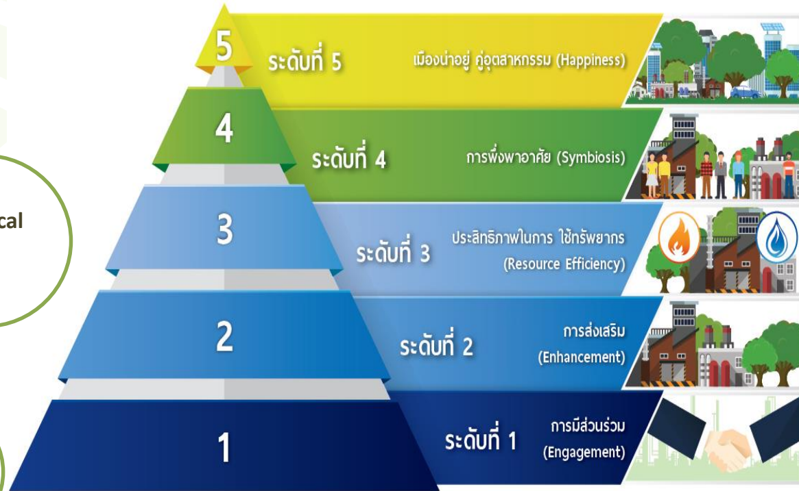
Level of Eco Industrial Town 5 Level

REF: Handbook For Eco Industrial Town, Department Of Industrial Works 2018