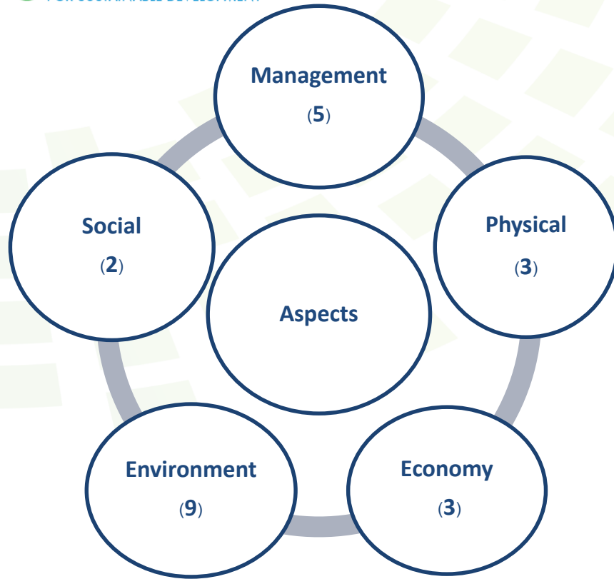
Eco Industrial Town Characteristics