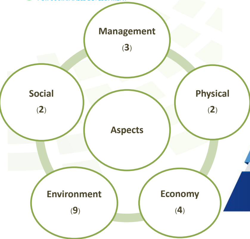
Eco Industrial Town Characteristics