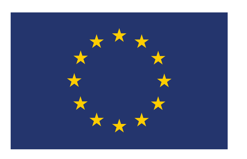
Funded by the European Union