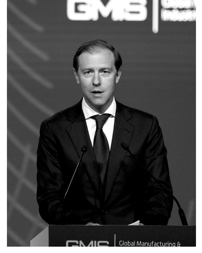
Denis Manturov, Minister of Industry and Trade, Russian Federation, said the changes being brought about by advanced technology would make manufacturing more efficient and raise living standards for the whole world. However, each previous cycle of the industrial revolution had led to an increase in humanity's environmental footprint, climate change, pollution, and ecological degradation.