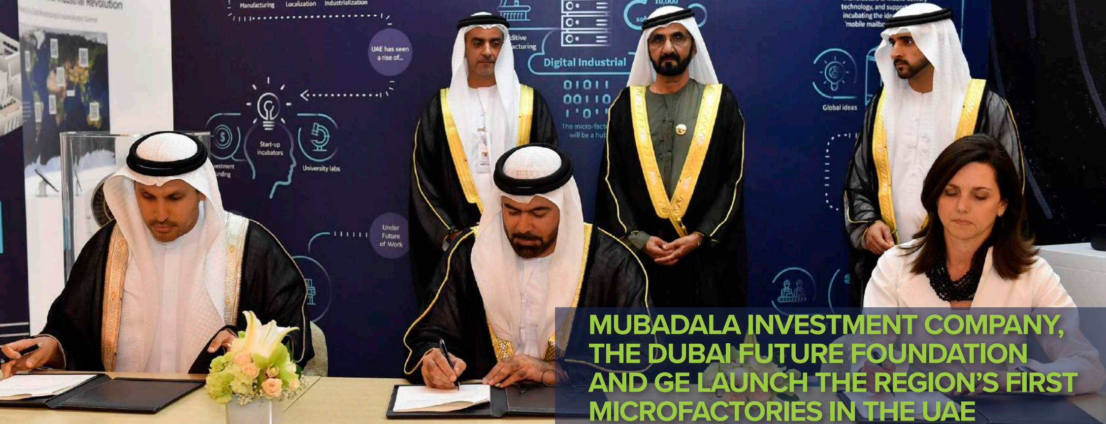
MUBADALA INVESTMENT COMPANY, THE DUBAI FUTURE FOUNDATION AND GE LAUNCH THE REGION'S FIRST MICROFACTORIES IN THE UAE