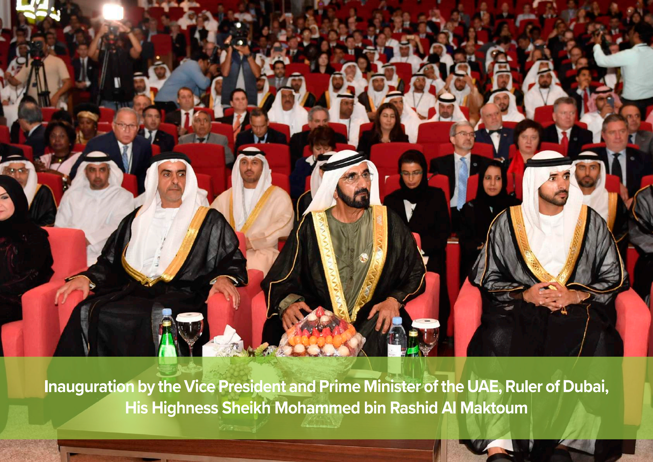
Inauguration by the Vice President and Prime Minister of the UAE, Ruler of Dubai, His Highness Sheikh Mohammed bin Rashid Al Maktoum