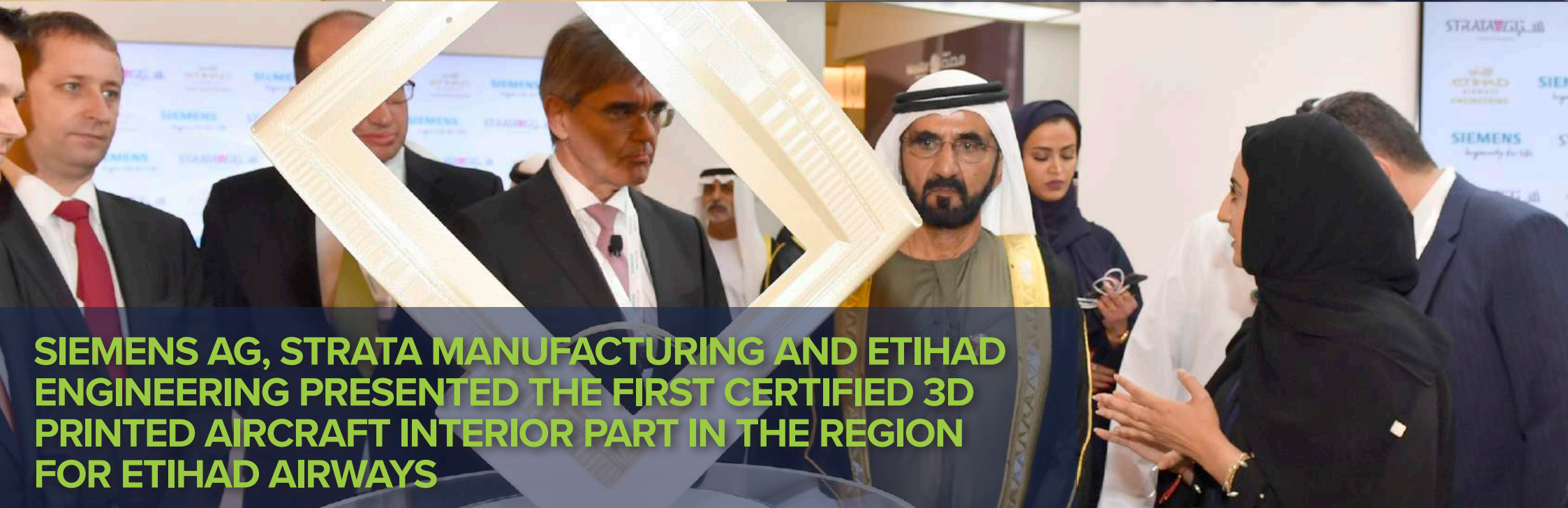
SIEMENS AG, STRATA MANUFACTURING AND ETIHAD ENGINEERING PRESENTED THE FIRST CERTIFIED 3D PRINTED AIRCRAFT INTERIOR PART IN THE REGION FOR ETIHAD AIRWAYS