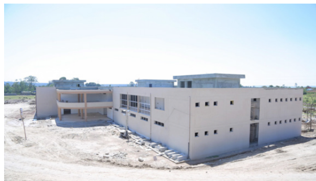
Construction complete at the Yirgalem IAIP (SNNP region).

The IAIPs and the surrounding rural transformation centers are 80-100% complete: Since the launch of this project, more than US$ 700 million has been earmarked from various development partners towards IAIP-related initiatives. To date, it has created approximately 21,000 jobs and attracted more than 150 private companies wishing to invest and relocate businesses within the parks. The construction of the Yirgalem IAIP in the Southern region is finished, 11 investors have signed contract agreements with the Regional Industrial Park Development Corporation, and an avocado processing company is already operating in the park.