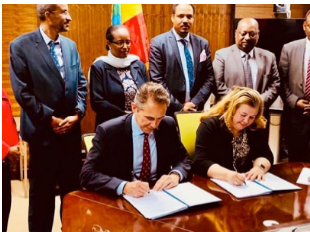
Signing ceremony of the UNIDO-EU cooperation agreement as part of PROSEAD, in the presence of Ethiopian Government representatives.

UNIDO will work to establish a coordination framework to harmonize the various stakeholder interventions related to the IAIPs, including PROSEAD itself, and accelerate the mobilization of public and private investments.