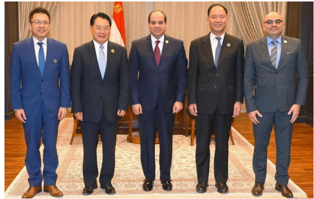
UNIDO delegation led by DG Li meets Abdel Fattah Al Sisi , President of Egypt, to discuss the PCP (December 2019).

National coordination body established and operational: Three meetings were already held in the course of 2019. The PCP coordination body is chaired by the Chief of the Prime Minister's office