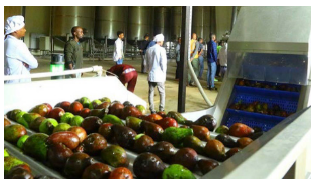
Avocado processing company at the Yirgalem IAIP.