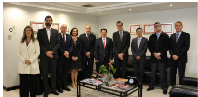
UNIDO delegation meets with the National Development Bank of Peru (COFIDE), at the occasion of the Director General's mission to Peru in June 2019.

The Development Bank of Latin America (CAF) and the Inter-American Development Bank (IaDB) have also voiced interest in supporting PCP projects, industrial policy development, and the implementation of the new strategy for industrial park development.