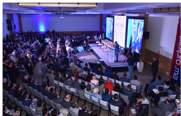
Morocco's Industry Meeting Day 2019.

In parallel, various activities were carried out to mobilize partners and identify concrete cooperation opportunities as the PCP moves towards implementation in 2020. Meetings on cooperation prospects were held with various bilateral and multilateral partners. A mapping exercise was conducted by UNIDO, in particular for collaboration with financial institutions and the business sector. Closer synergies were also established with the national private sector and international enterprises.