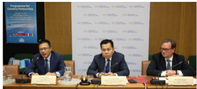
Partner briefing on PCP Cambodia held at UNIDO Headquarters, Vienna, September 2019.

Capacity-building for industrial policymaking: PCP Cambodia is supporting the government in implementing its industrial development policy for the period 2015-2025, but also in enhancing national capacities in policy design, monitoring and evaluation. This is being done through a capacity-building project of US$ 1.2 million funded by the Republic of Korea. A complementary project, funded by China, is helping to develop industrial statistics and monitor the PCP's contribution to the implementation of Cambodia's Industrial Development Policy (IDP) and progress towards the Sustainable Development Goals.