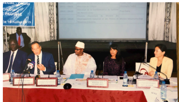
PCP Steering Committee validates road map for 2019-2020.