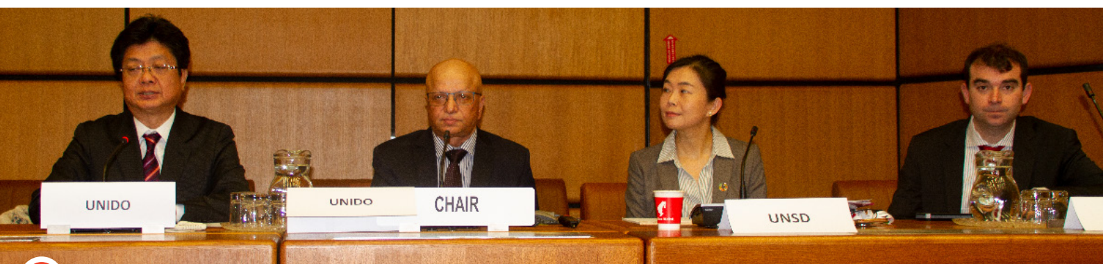
..... International workshop on data and statistics for evidence-based Voluntary National Reviews (VNRs)

The workshop brought together more than 40 participants representing national statistical offices and policymaking bodies of different Member States as well as representatives from UN agencies and international non-governmental organizations. Participants presented the national SDG monitoring mechanisms and processes and discussed the measurement gaps that impede monitoring of national policies.