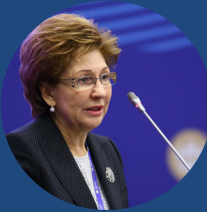
Ms. Galina Karelova Deputy Chairperson Council of the Federation of the Federal Assembly of the Russian Federation