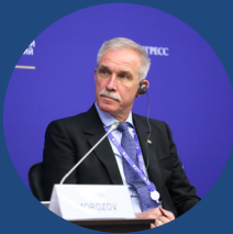
Mr. Sergey Morozov Governor of the Ulyanovsk Region