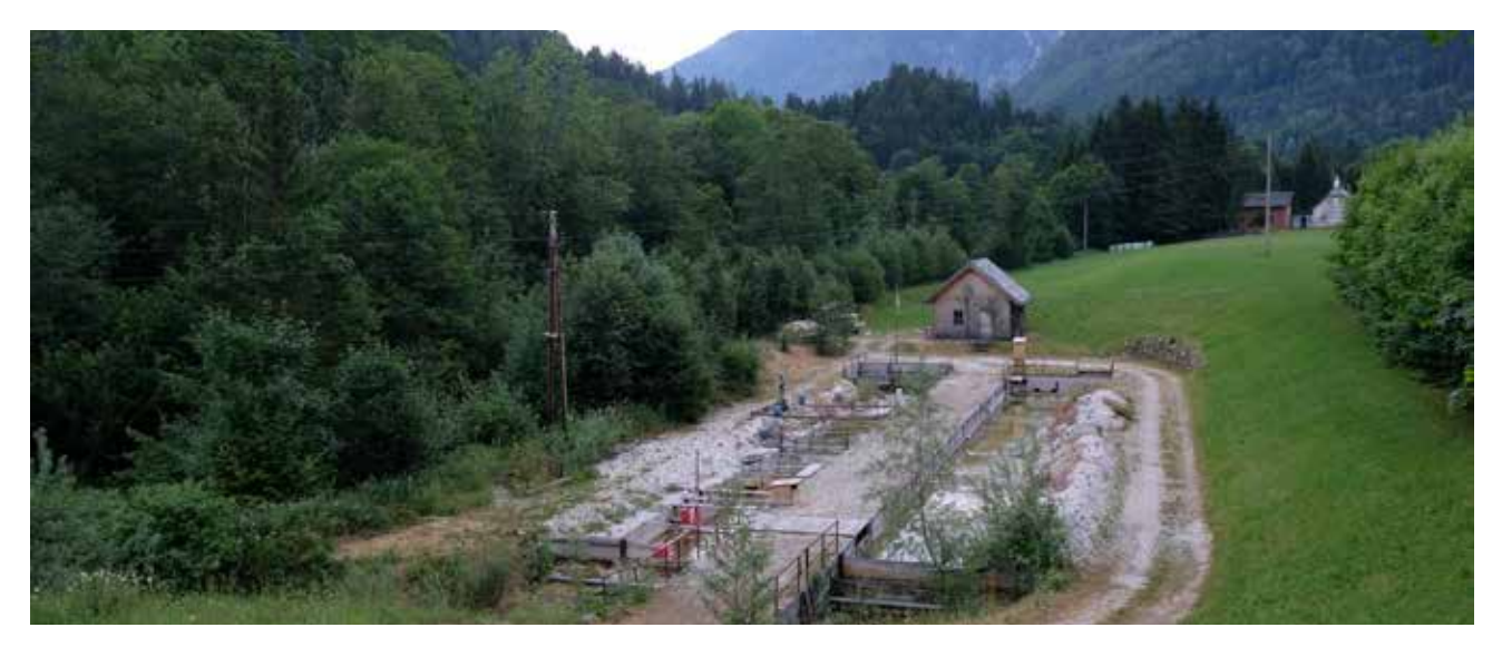
Figure 4. Research facility hydromorphological and temperature experiment channel

Incentives are needed to guide the development of green SHP. Scientific findings and cost-effective technologies play an important role in accelerating the restoration of riverine reaches impacted by SHP development.