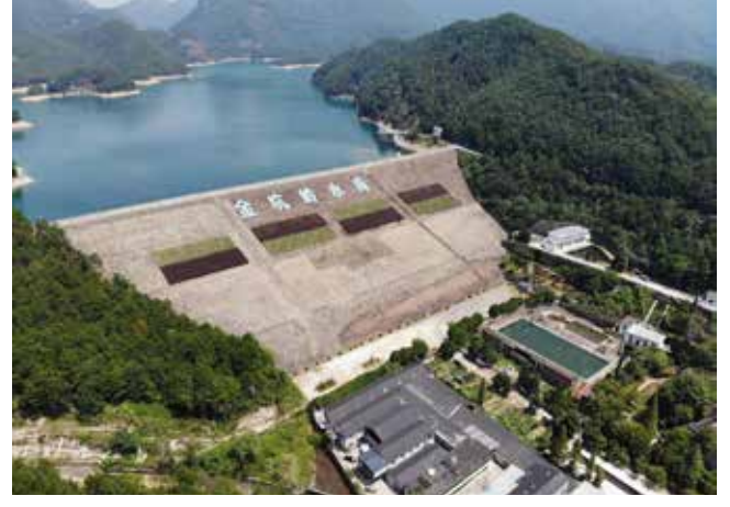
Figure 3. Jinkeng Ling SHP in Zhejiang (1,250 kW)