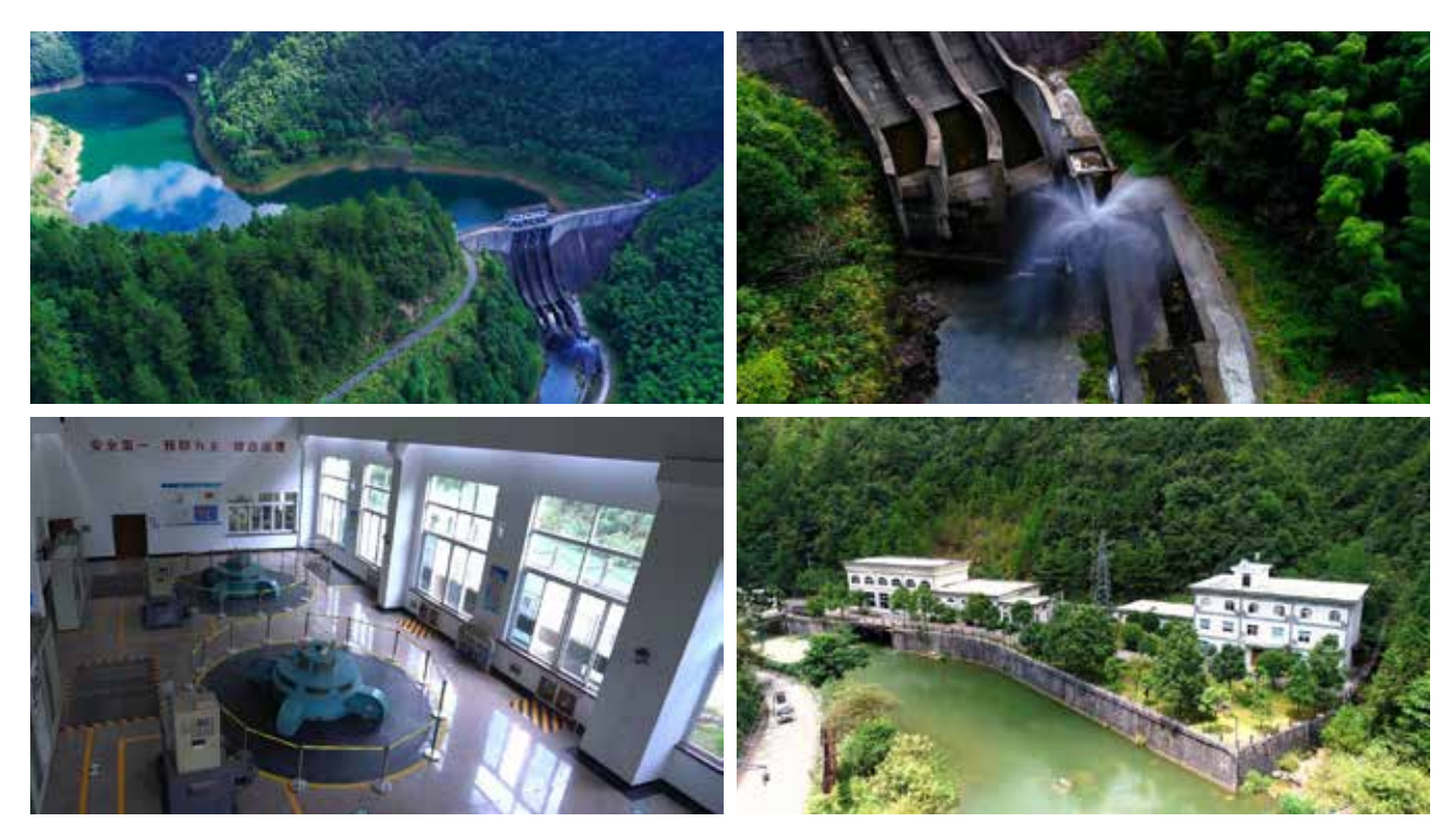
Figure 5. Anming First Cascade in Songyang, Zhejiang Province Note: Total capacity is 2 x 6.3 MW, reservoir storage capacity is 3.32 million m3, an 80 cm pipe was installed at the bottom of the reservoir for ecological flow discharge.