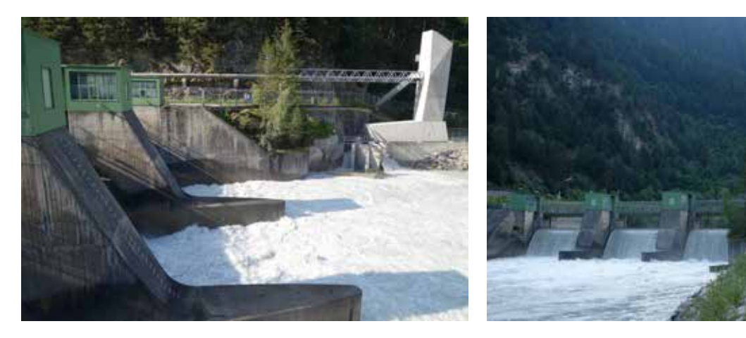
Figure 2. Fish lift in Runserau