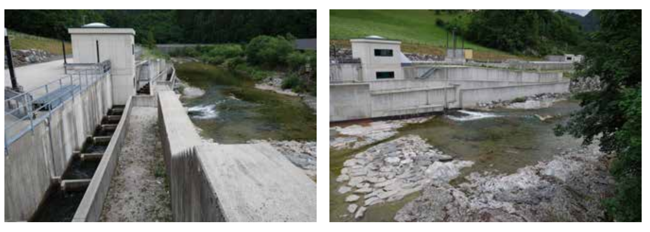
Figure 3. Fish pass and residual turbine at the Opponitz hydropower plant

to submit projects related to river continuity and ecological minimum flow, and the measures had to be licensed and implemented according to strict timelines.