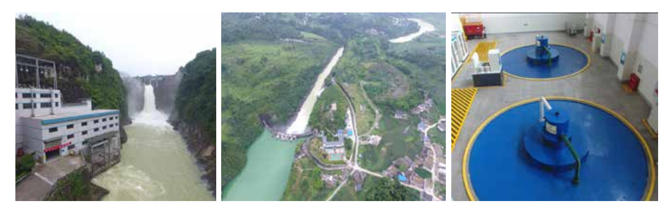
Figure 2. Qingxi SHP in Guizhou