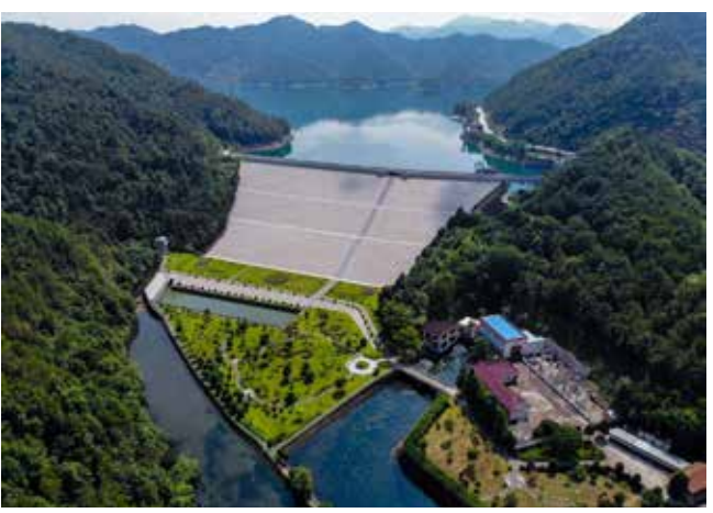
Figure 4. Hengjin First Cascade in Zhejiang Province (9,750 kW)