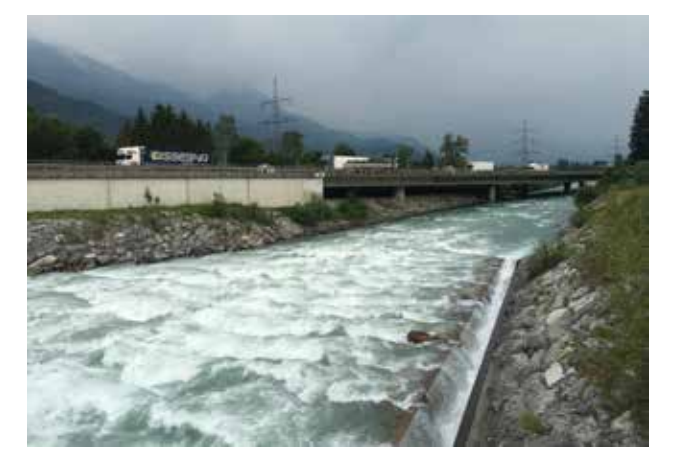
Figure 1. Dabalada ramp offering possibility of ascent for fish

Ecological flows (Eflows) as a hydrological regime consistent with GES shall ensure the good functioning of the ecosystem according to river type-specific biological conditions. The Austrian Water Act of 1990 requires that water abstraction has to be restricted so that an ecological minimum flow to achieve GES is guaranteed. In 2010, the Eflows to achieve good status (base flow and dynamic aspect) were defined in the ordinance on quality objectives for rivers and lakes. Requirements covering ecological minimum flow, ecological continuity (fish pass) and hydro-peaking are stipulated in the ordinance in detail with legal binding.