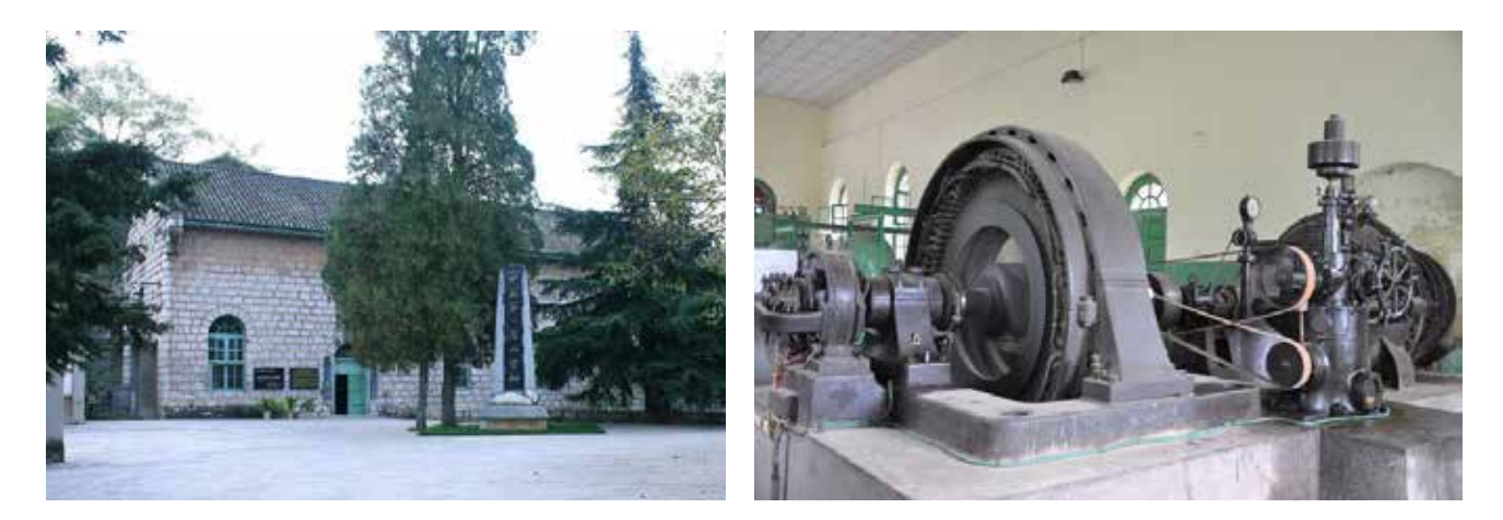
Figure 1. Shilongba SHP in Kunming, Yunnan Province Note: China's first SHP, with installed capacity of 240 kW, is still operating.

A new competitive market, which allows the trade of green SHP electricity and has a different pricing system from that of the conventional power market, shall be created. This is called the green certificate market. The trading mechanism of green certificate not only opens up a sales channel for green power, but also ensures its optimized allocation and reasonable supply.