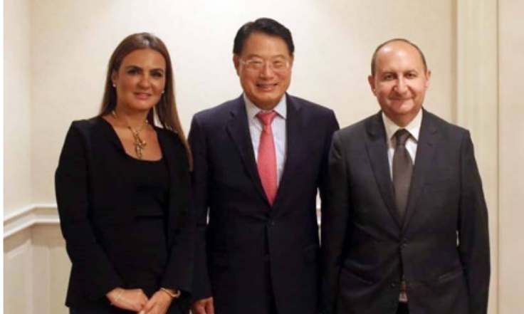
Egypt's Minister of Trade and Industry Amr Nassar (R) and Minister of Investment Sahar Nasr (L) during their meeting with director-general of the UNIDO Li Yong