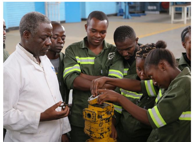
Technical and vocational education and training through the ZAMITA project in Zambia (pre-COVID 19).

UNIDO engaged in the mid-term review of the United Nations Sustainable Development Partnership Framework (UNSDPF) 2016-2021 and collective efforts to mitigate the impacts of COVID-19: UNIDO is working with UN sister agencies and the Resident Coordinator for Zambia in the ongoing review of the UNSDPF. It provides an opportunity to align the new PCP with the priorities of the revised UNSDPF, and further engage with the UN Country Team (UNCT) in its collective efforts to support Zambia's Multi-Sectoral Contingency and Response Plan to COVID-19. UNIDO already provided inputs to the UNCT Flash Appeal related to COVID-19, with a focus on projects supporting skills development and job creation through contributions of the Zambian Industrial Training Academy (ZAMITA) project.