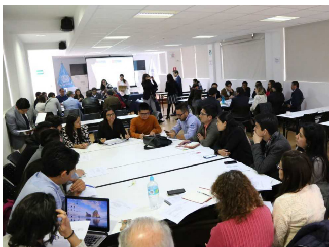
Validation of the road map during workshop held at the premises of the National Industry Association in Lima, Peru (pre-COVID 19).

Government approves the PCP supported “Road map towards circular economy in the industrial sector”: The road map will support transition from linear to circular economy in the manufacturing and fish processing industries, through 42 lines of action and different approaches. The Ministry of Production and the Ministry of Environment developed the road map with the technical and advisory support of UNIDO. This was mainly part of the Partnership for Action in Green Economy (PAGE) programme and other complementary initiatives related to circular economy, including a study on the needs and capacities of the CITE Network, developed in collaboration with Peru’s Technological Institute of Production. Approved in February 2020, the road map is part of the policy measures of the new National Plan for Competitiveness and Productivity.