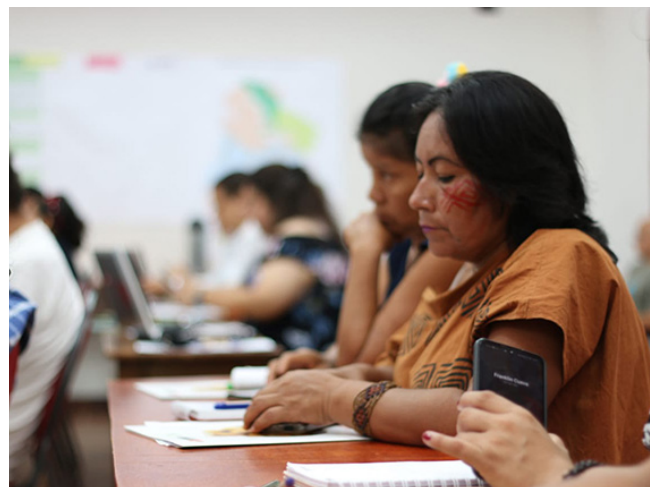
Validation workshop carried out within the framework of the Global Environment Facility-funded project supporting food security and enterprise development in the Peruvian Amazon in the context of climate change (February 2020).

Peru proposal part of the first financing call of the Joint Sustainable Development Goal (SDG) Fund: The proposed programme aims to support sustainable financing for Peruvian bio-businesses in the Amazon. Supported by the UN Resident Coordinator in Peru, it was jointly developed by UNIDO, the Food and Agriculture Organization (FAO), the International Fund for Agriculture Development (IFAD) and the International Labour Organization (ILO), for funding consideration by the Joint SDG Fund. The results of the call are expected in July.