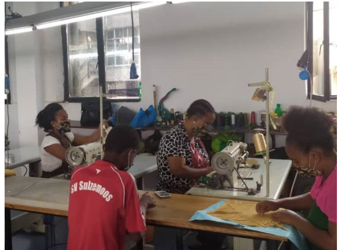
A women-led SME adapts to safety measures at new premises allocated by the Government of Ethiopia, supported by UNIDO.

Planning for Ethiopia's recovery from COVID-19: UNIDO is working with the UN Country Team in Ethiopia in the preparation of the socio-economic impact assessment of COVID-19. The PCP is expected to play a key role in three UN joint programmes being developed targeting economic recovery and job creation in the post-crisis phase. The joint programmes will focus on agriculture and manufacturing, targeting both the formal and informal economy, in particular: (i) Guiding business recovery for micro, small and medium enterprises; (ii) Job creation in urban areas, including in industrial parks; and (iii) Rural development.