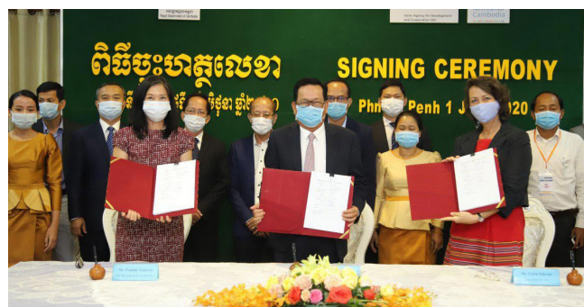
Launch of a new project to support youth employment in Cambodia.

Green Climate Fund (GCF) to support technology needs assessment for SEZs: Funded by the GCF Readiness Programme, the new project will support institutional capacity-building, coordination in climate action and finance, and the de-carbonization of the SEZ in Sihanoukville. UNIDO acts as the delivery partner for this GCF Readiness project, in line with the Framework Agreement signed between the two entities in 2018. The GCF proposal was developed by UNIDO in close coordination with the national counterparts, and will be implemented under the framework of PCP Cambodia.