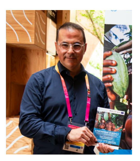
Patrick Gilabert, UNIDO Representative to the European Union, OACPS and Belgium

The small size of the pictures illustrated the small steps needed to achieve big changes. This is precisely what UNIDO — EU partnership is about: concrete actions on the ground, joint projects, large impacts on people and on the planet.