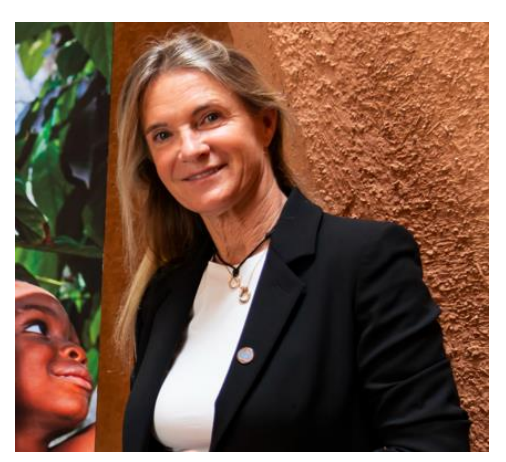
Elisabetta Lattanzio Illy, UNIDO Goodwill Ambassador

"It is an honour to be able to exhibit these pictures in the Austrian pavilion, a concrete example of sustainability and resilience. Through photography, you can identify what a population needs and then determine what you can offer. It is sometimes difficult to convince people to have their picture taken. But it is through dialogue that we will strengthen cooperation and promote mutual support. Respect must be the compass that guides our choices."