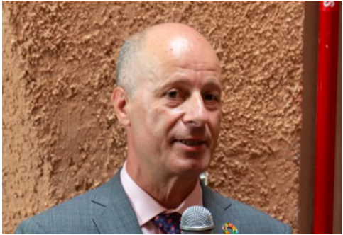
Nasser Maher, Commissioner-General of the United Nations at Expo 2020

"The choice of photos to show respect is relevant because a photo is worth 1000 words. The UN promotes dignity and peace. Achieving the agenda for sustainable and inclusive development is our priority. We need to rethink how we are developing."