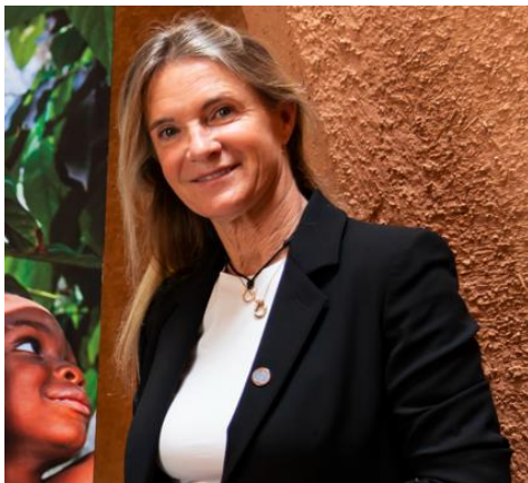
Elisabetta Lattanzio Illy, UNIDO Goodwill Ambassador

"It is an honour to be able to exhibit these pictures in the Austrian pavilion, a concrete example of sustainability and resilience. Through photography, you can identify what a population needs and then determine what you can offer. It is sometimes difficult to convince people to have their picture taken. But it is through dialogue that we will strengthen cooperation and promote mutual support. Respect must be the compass that guides our choices."