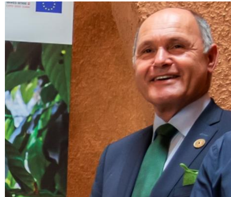
Wolfgang Sobotka, President of the Austrian Parliament

"This occasion is an opportunity for dialogue on the transformation of our economies. Industrial development in the 21st century must be sustainable and respectful. UNIDO continues to be a key player in this transformation, promoting and advocating the SDGs. Respect for all must be part of the future economic development of us all."