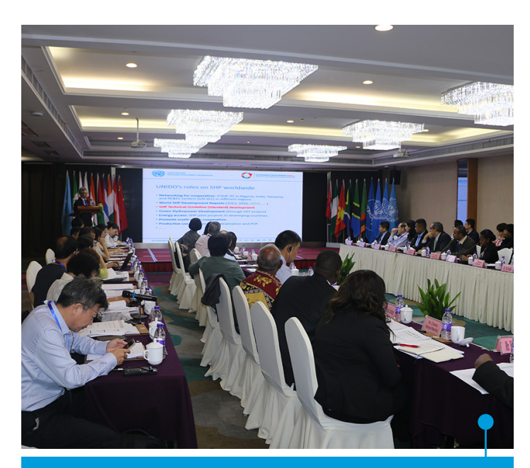
IWA Workshop held in June 2019 in Hangzhou, China

This project stresses the importance of establishing a common framework for SHP planning, construction and operation worldwide which will borrow and compile best practices from existing SHP standards, allowing a more consistent development of the technology.