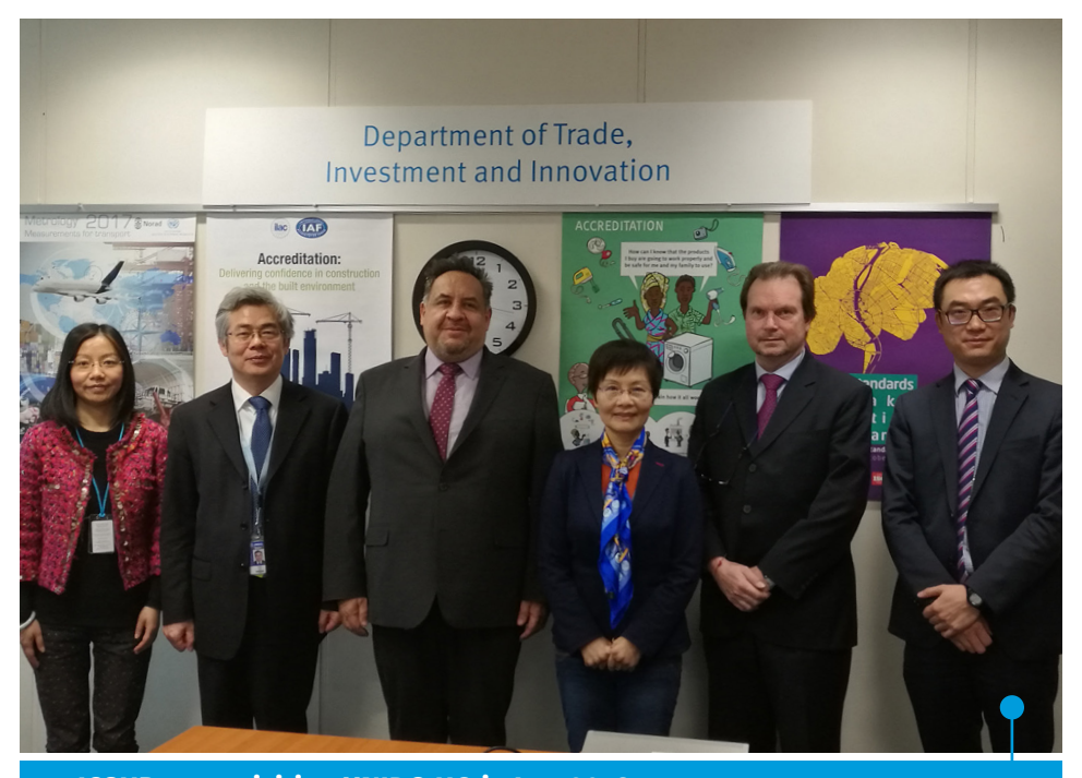
ICSHP team visiting UNIDO HQ in Jan. 2018

The project aims to develop a small hydropower (SHP) technical guideline which will serve as basis for the development of international standards for SHP development. The project will be part of UNIDO effort with the strategic partner at helping developing countries in the application of clean energies. Funded by the Government of China, the project promotes creating job opportunities through sustainable industrialization.