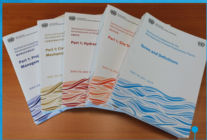
Small Hydropower Technical Guidelines booklets

It is expected that international experts from stakeholder organisations will be invited to provide input for the project. There will be several international peer reviews to set the path for the development of the technical guidelines, furthermore, for an international standard development for SHP.