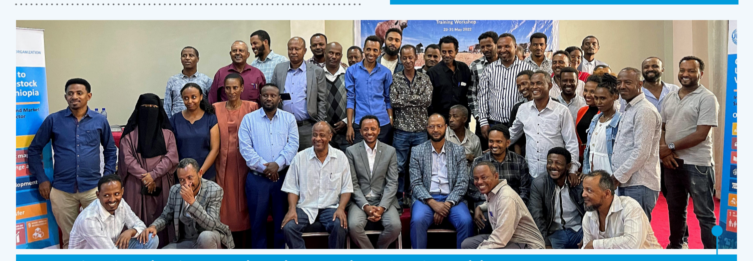
Group photo following the completion Animal Handling and Welfare Training