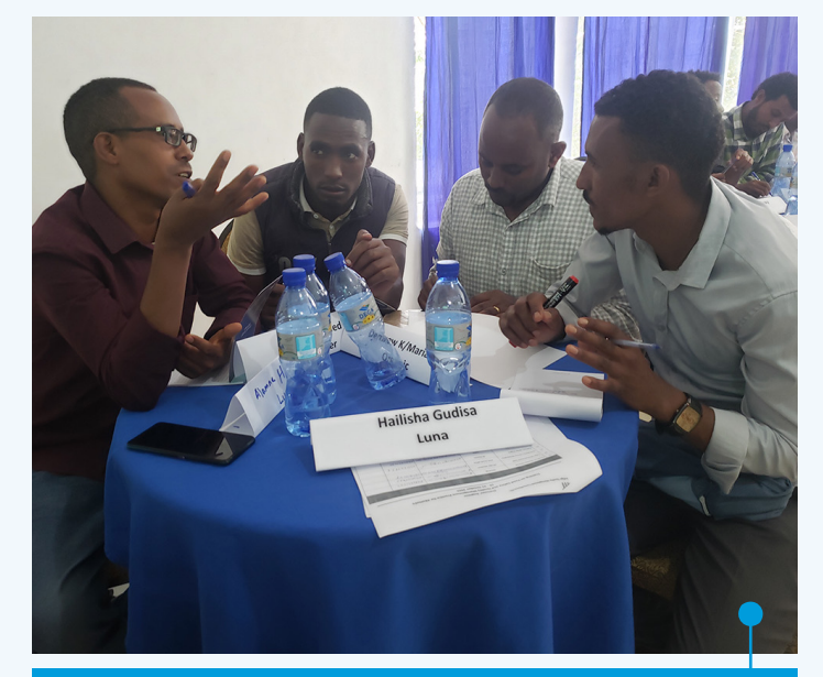
Group discussions during the food safety and quality management - ISO standards training

Lessons learned from the implementation of this project can be replicated and applied to other Developing and Least Developed Countries.