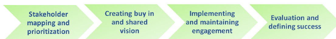
Figure 2. A four-step process for engaging ecosystem actors

Figure 2 presents a four-step process for engaging ecosystem actors.