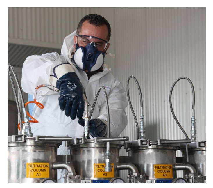
Phase-Out of Ozone-Depleting Substances

By reducing the amount of POPs produced, used and emitted by industry, the activities of the Department in this area contribute to the long-term conservation of our natural environment and to reducing a major human health risk. Furthermore, inclusiveness is promoted by building local technical capacities, and by raising awareness of the dangers of POPs throughout local small-scale industries and communities. South-South knowledge and technology transfer further facilitates mutual learning between industries to reduce and eliminate POPs. Lastly, environmental upgrading through the sharing and transfer of best available techniques (BAT) and best environmental practices (BEP) ensures the longevity and global competitiveness of participating industries.