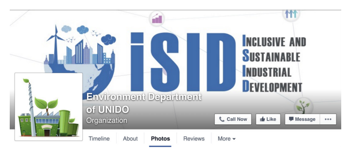
UNIDO's Online Presence