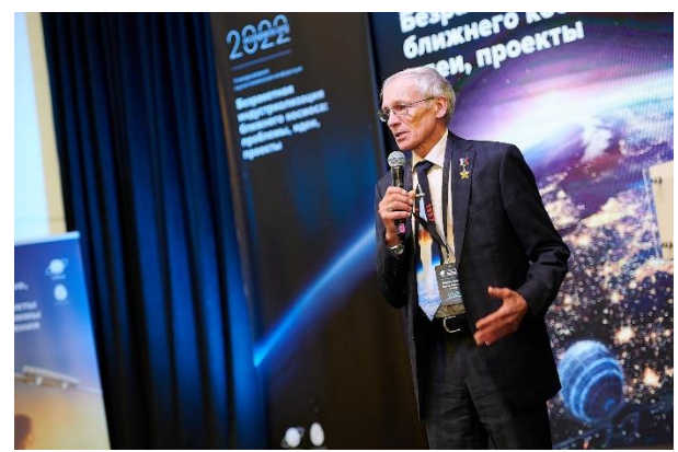
Pilot-Cosmonaut, Hero of the Russian Federation Sergey Avdeev

"The tasks of industrial space exploration and the implementation of projects within the framework of the international platform EcoWorld can become an important part of the concept of sustainable development with practically applicable results" he said.